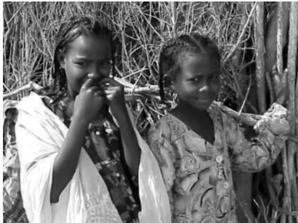
Two girls in Foro, one of the villages visited in the national malaria prevalence survey

Eritrea lies along the Red Sea coast in the Horn of Africa, at the northernmost limit of malaria transmission in the region. About two-thirds of its 3.5 million people live in malaria endemic or epidemic-prone areas, and malaria accounts for approximately 30% of clinic visits and hospital admissions.