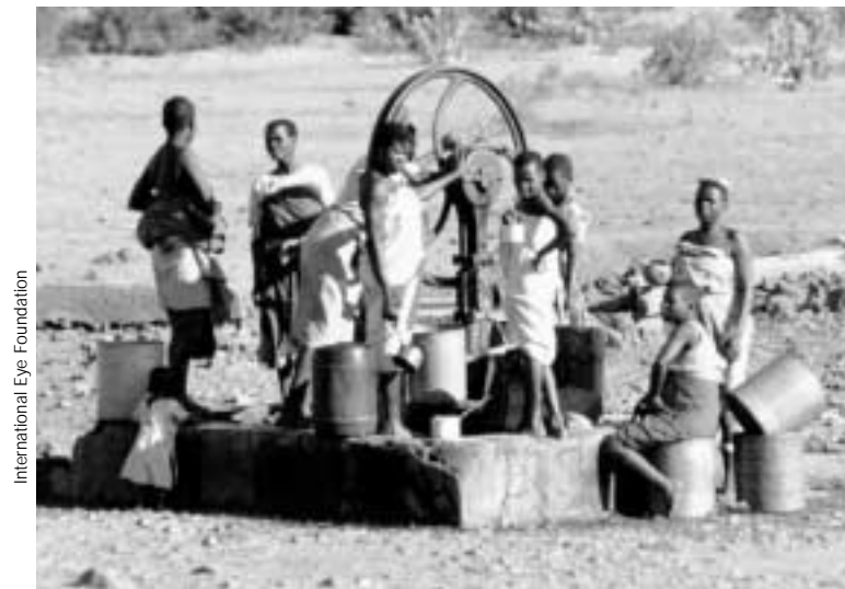
International Eye Foundation